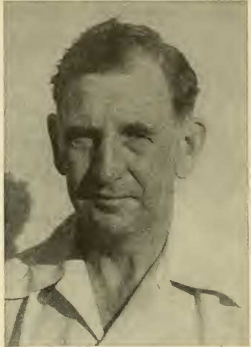
F. G. BROWNE

Line 8 and 9 (in Cyclopaedia, p. 83b) read as follows: 'Porpoise', FLINDERS proceeded in the